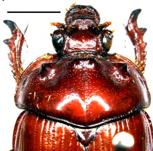
Figure 3: B. phallosum (scale: 5 mm), ZSI/CZRC-A/16604, Pench Tiger Reserve, 2001.

Remarks: B. calanus (Westwood, 1848) and B. phallosum Krikken, 1980 show close resemblance in their morphological characters and cannot be separated on the basis of external characters only, but the phalli of both the species are very different and only the characters of the phallus distinguish both the species.