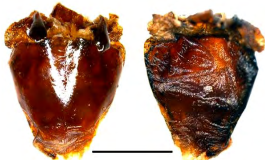
Figure 8: Dorsal & ventral view of external male genitalia of B. laterale (scale: 2 mm), ZSI/CZRC-A/16730.

Remarks: The species can be easily distinguished from its close members, B. marginale Krikken, 1980 and B. kuijteni Krikken, 1980 having only one pair of lateral pronotal protrusions and abundantly punctate pronotum.