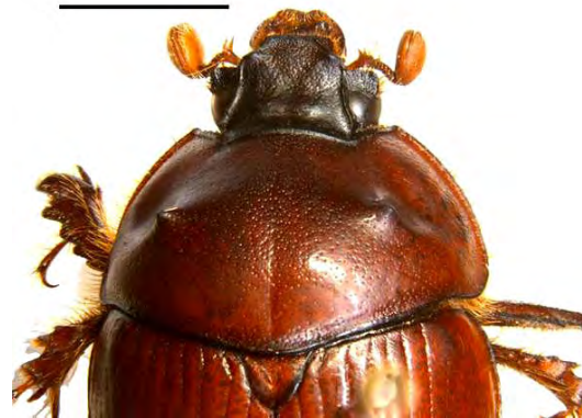
Figure 7: B. laterale (scale: 5 mm), ZSI/CZRC-A/16730, Singhori Wildlife Sanctuary, 2009.

Diagnosis: (Fig. 7) Cephalic tubercles dentiform and placed on lateral margins. Paramedian tubercles of pronotum well separated by more than inter ocular distance. Lateral tubercles almost absent. Median cavity of pronotal disc absent. Punctuation on pronotal disc abundant. Front tibia with eight denticles.