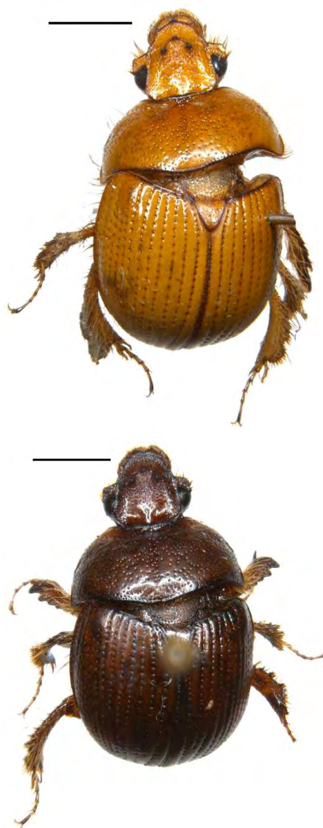
Figure 9: Variation of B. insidiosum (scale: 2 mm), ZSI/CZRC-A/16605 & 16778, Singhori Wildlife Sanctuary, 2010 & 2011.

Remarks: The species shows variation in the shape of clypeus, ornamentation of frons and vertex. (Fig. 9 a, b).