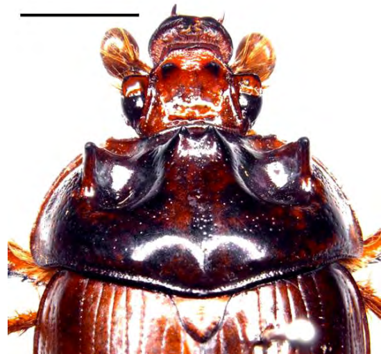
Figure 1: B. calanus (scale: 5 mm), ZSI/CZRC-A/16601, Barnawapara Wildlife Sanctuary, 2011.

throughout. Paramedian tubercles separated by less than inter-ocular distance. Lateral impression of pronotum shallow.