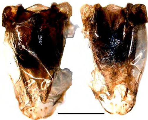
Figure 6: Dorsal & ventral view of external male genitalia of B. marginale (scale: 2 mm), ZSI/CZRC-A/16599.

External male genitalia: (Fig. 6) Parameres reduced and basal capsule enlarged. Basal capsule of the phallus very robust in comparison to B. laterale (Westwood, 1848) and B. kuijteni Krikken, 1980.