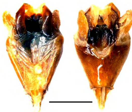
Figure 4: Dorsal & ventral view of external male genitalia of B. phallosum (scale: 2 mm), ZSI/CZRC-A/16604.