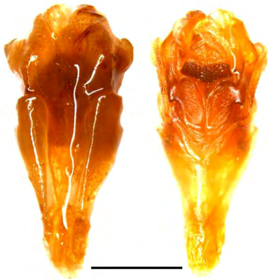
Figure 2: Dorsal & ventral view of external male genitalia of B. calanus (scale: 2 mm), ZSI/CZRC-A/16601.

New state and district record: Chhattisgarh (Raipur) and Madhya Pradesh (Umaria and Seoni).