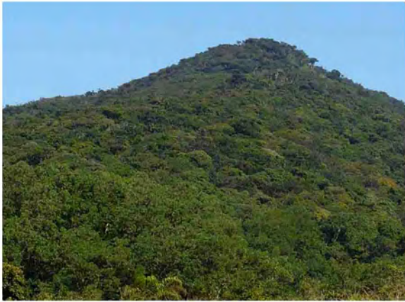
Fig. 01: Kukulugala Mountain