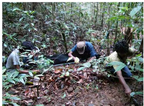
Fig. 08: Field work in Kukulugala forest