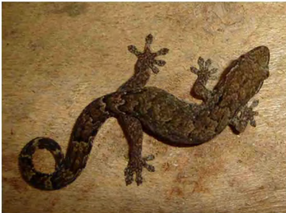
Fig. 03: Lepidodactylus lugubris