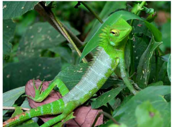
Fig. 04: Calotes calotes