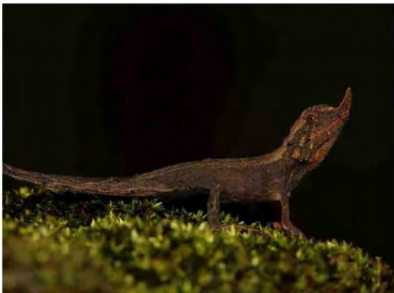
Fig. 05: Ceratophora aspera