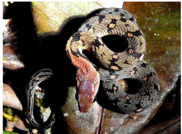
Fig. 06: Balanophis ceylonensis