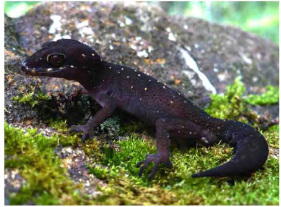
Fig. 02: Geckoella triedrus