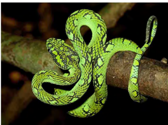
Fig. 07: Trimeresurus trigonocephalus